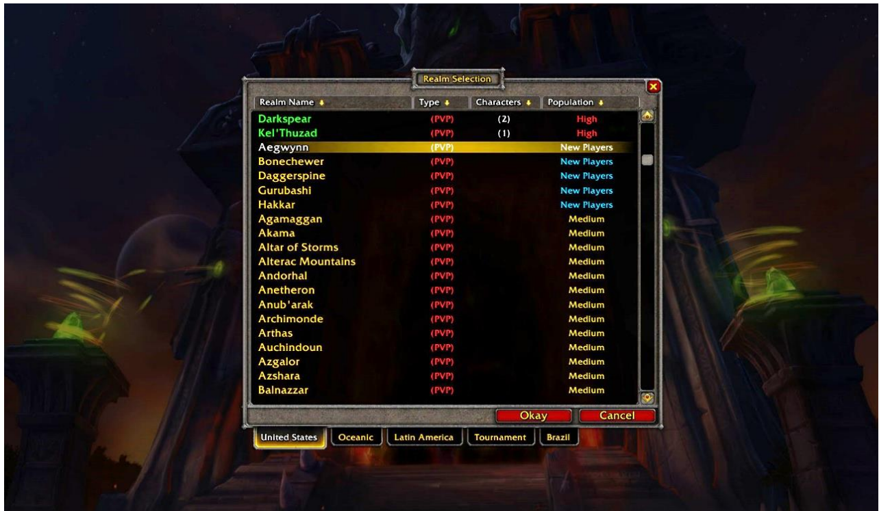
Figure 1. 8 Realm Selection Screen.

such as name restrictions and special speech and behavior codes. Finally, there are role-playing player versus player servers (RP-PvP) which combine the restrictions of an RP server with the combative freedom of PvP. RP and RP-PvP server locations are beyond the scope of this research. As noted previously, I conducted most of this research on a PvE server, though I made brief forays onto PvP servers Tichondrius and Illidan. Tournament servers are access-restricted for competition and are beyond this research scope.