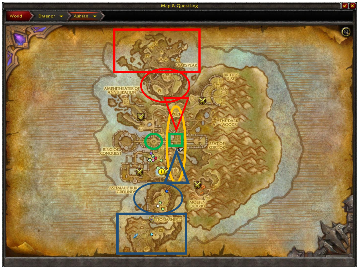
Figure 14: Map of Ashran Locations

In Ashran, the Horde leader is High Warlord Volrath (called Vol), and is located in a large building in the Horde fortress (the red circle above). The Alliance leader is Grand Marshal Tremblade (called Trem), and is located in a large building in the Alliance fortress (the blue circle). The squares are the established footholds of each faction (Warspear and Stormshield), while the circles are their fortresses within the Ashran PvP zone. The gold oval is the Road of Glory, which has five strategic locations (factions plant their flag to denote control, and these locations are called F1, F2, F4, F5). Crossroads (called XR, green box) is the third strategic location, located just above my position, indicated by the small white arrow. It is especially valuable since it grants easy access to