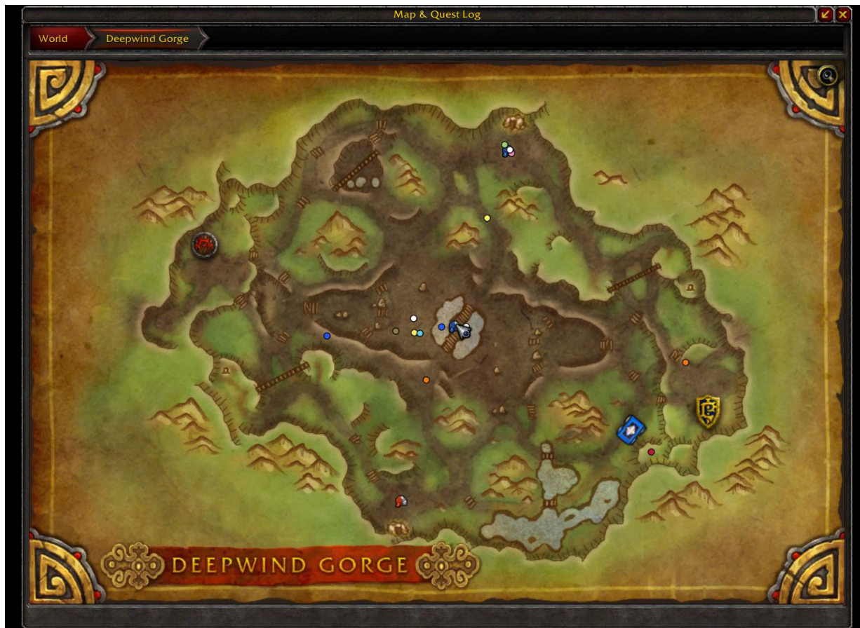
Figure 5: Deepwind Gorge area map.

For example, players may have no issues with lag in a 10v10 or 15v15 battleground. The geographical area is small, there are no more than 20 or 30 players in the area, and players tend to be somewhat spread out, such as in a Deepwind Gorge event, seen above. Figure 5 shows the location of enemy gold at the far left and right sides of the map, with three central locations (upper, middle, and lower) that can be captured and defended in order to acquire resources. The dots are friendly players, who are dispersed in small groups around the event geography. Even with the spell effects, pets, mounts, and other additional graphical rendering requirements, this is a fairly manageable situation for most computers used in gameplay. In contrast, Ashran is a large geographic zone, and