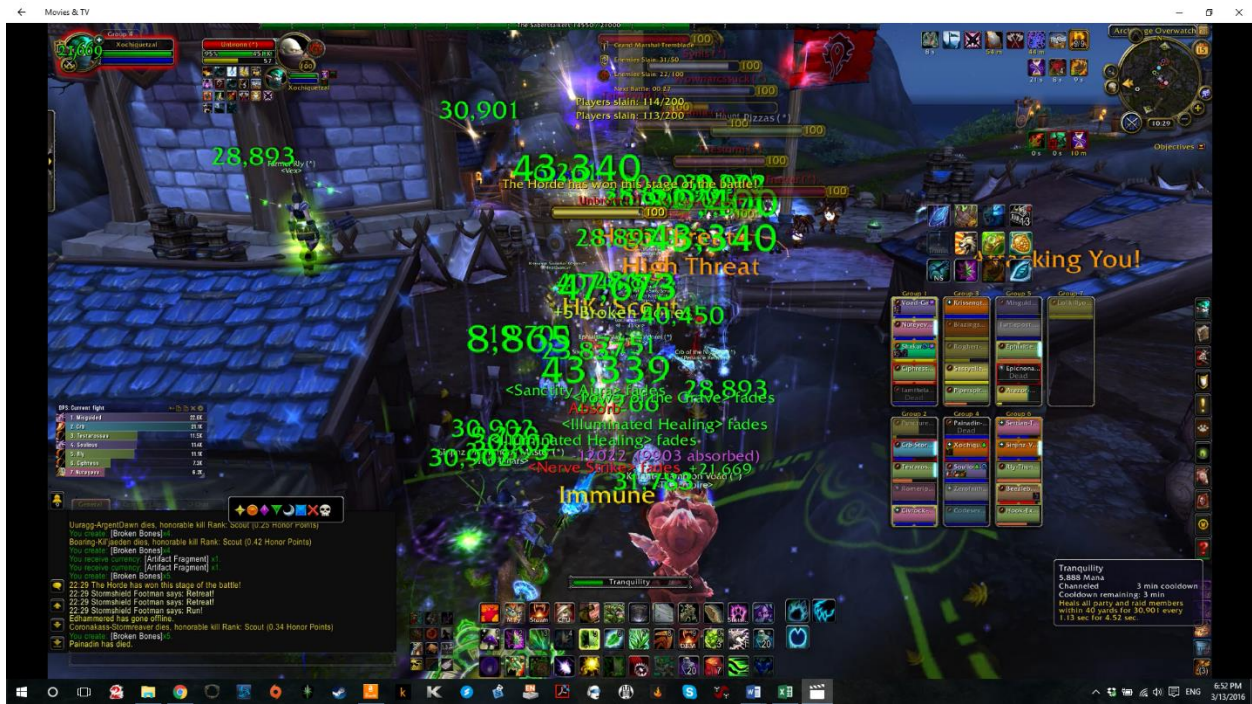
Figure 6: Ashran: Battle of Two Armies.

as a 40v40 there can be up to 80 players in the zone at a given time (as in Figure 6. For area map, see Figure 8). Add to this the various NPCs, spell effects, and pets, and lag can become a real issue.