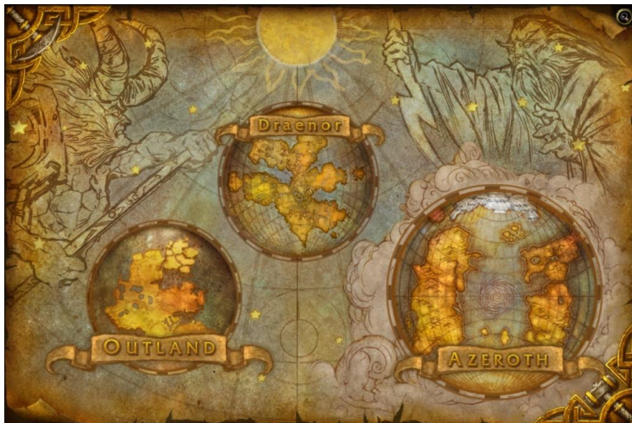
Figure 12: The Three Worlds of World of Warcraft.

Ashran is a geographic location in Draenor, the alien world where Warlords of Draenor is set ( Azeroth is the home world of most playable toons and the starting world of all toons).