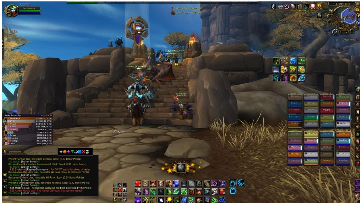
Figure 7: A Moonkin controls the Ancient Artifact.

In summation, PvP partner preference is largely dependent upon the type of PvP event. While arenas have specific and rigid requirements for skill and class specialization, RBGs are more flexible, since having more teammates disperses some of this restrictive tension. Non-ranked and large-scale PvP play such as random battlegrounds or Ashran further disperse and even negate the necessity of class-specific positions, since there are multiple players who perform necessary functions and overlap to compensate for ineptitudes. This is especially true in the 40v40 events, where unskilled players may not even be noticed. If they are noticed, they may never be called to account or otherwise reproved for failing to adequately contribute. This is not to say unskilled players are always ignored. It is equally possible they will be harassed, assisted, or trolled. The difficulty and stress of finding competent players is dissipated as size of the group increases, until it is nearly non-existent in casual 40v40 events.