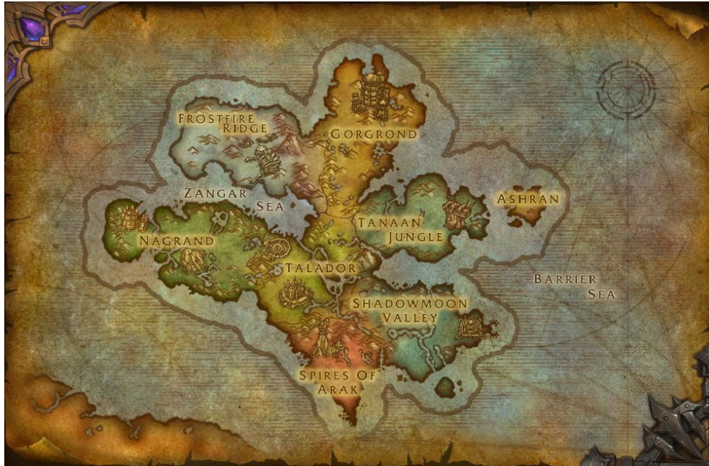
Figure 13: The Continent of Draenor.

Ashran is the island on the right side of the above map, and narratively is a contested zone; both Horde and Alliance factions struggle for military control. The Horde controls the northern tip, a place called Warspear, while the Alliance controls the southern tip, called Stormshield. These two bases of operation contain banks, auction houses, profession trainers, gear vendors, inn keepers, portals to all the major cities of the faction, and entrances to the Ashran PvP zone. Unlike other PvP events, players must physically enter the Ashran zone to queue for the event. Once queued, players are ejected from Ashran to wait for their turn, and most players wait in Warspear or Stormshield. As a result, these locations are bustling hubs of social and economic activities. Unlike almost all other PvP (except for World PvP), Ashran is an unending battle. Players cycle in and out of the zone, but the struggle never ends. Players entering an event can stay in the event for hours or even days (theoretically; I do not know of anyone who has done this, but it should be technically possible).