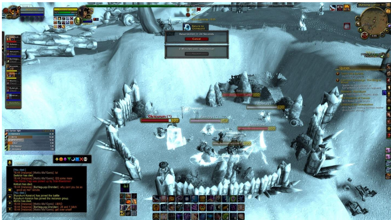
Figure 9: Spawn Trap in Warsong Gulch.

repeatedly killed in such a manner are “farmed” which remains a frustrating experience. This has the potential to happen in battlegrounds on a group scale specifically where enemy players will drive teams back to their resurrection location and then “farm” that location. Such a maneuver is called a “spawn trap” (Figure 9) as it involves players killing the opposing team as soon as they “re-spawn” (resurrect). This tactic capitalizes on superior power to constrain enemy players, while several team members complete the objectives to win the encounter. Although opposing players have very little social interaction, their very presence adds random and unpredictable twists to PvP encounters. Such types of experiences operate in similar ways to the anthropomorphized WoW , since neither “the game” nor enemies interact with players socially.