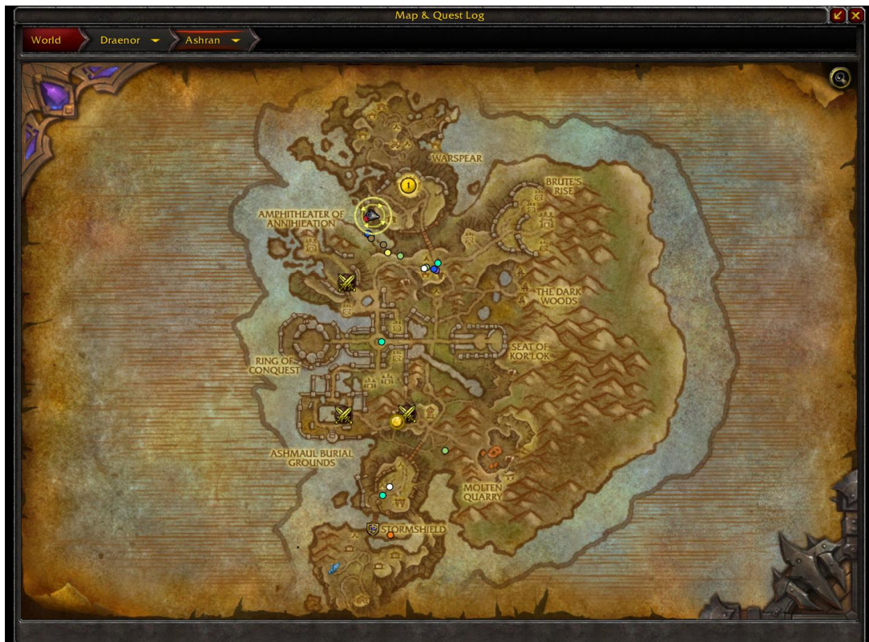
Figure 8: Map of the Ashran PvP Zone.

What is interesting is that all three deaths occur within five minutes of each other. This implies something beyond “rude.” Perhaps some enemy players have decided to focus attention on H-M. H-M alludes to this when using the term “ganked” which suggests the enemy is intentionally ganging up on players’ as a way to frustrate them. In this case, ganking H-M has the additional benefit of preventing H-M from healing his/her team members. By ganking H-M the enemy players effectively accomplish two different objectives.