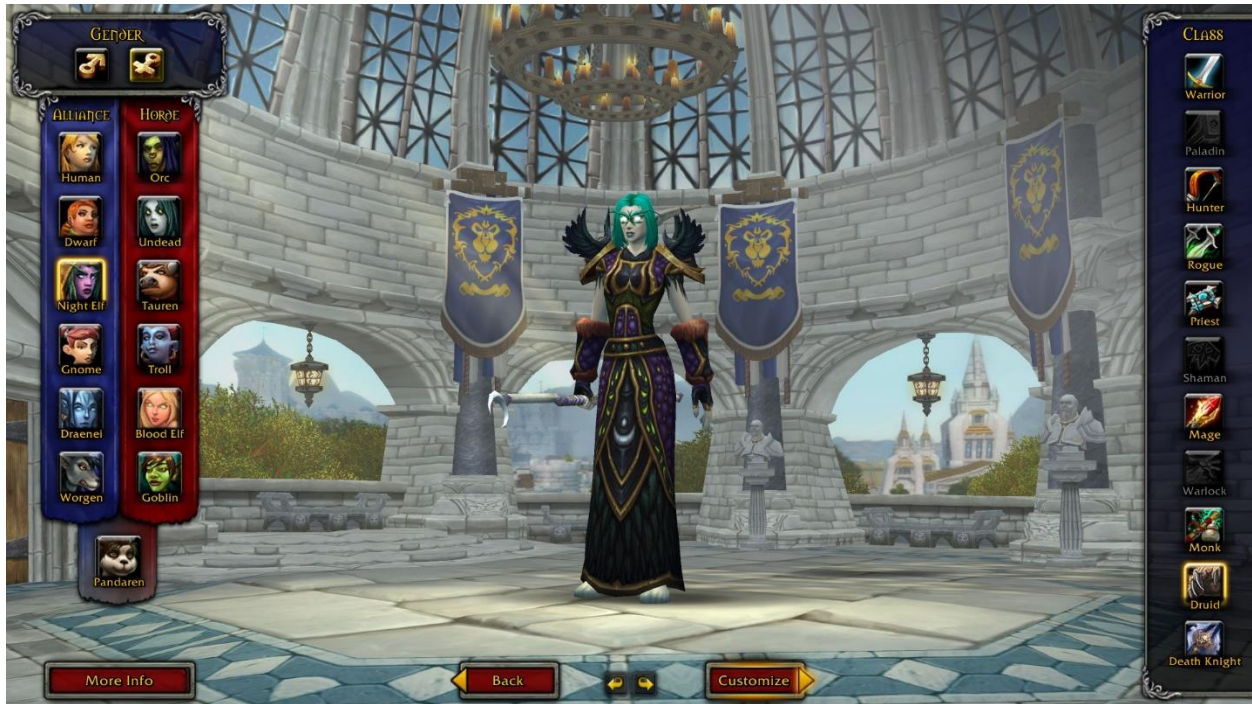
Figure 3: First Character Creation Screen.