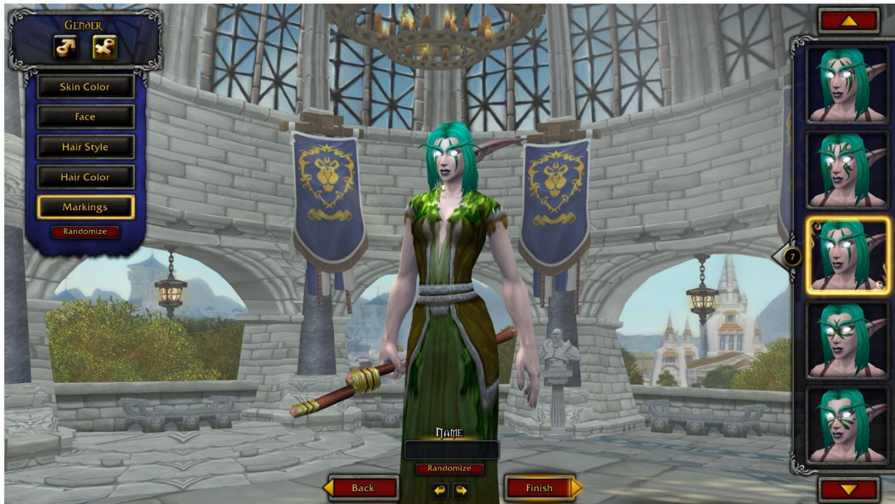
Figure 2: Second Character Creation Screen.

and avatar roles. Since WoW is similar to many role-playing games in what sorts of characters are permitted and how they are created, I will only briefly outline the possibilities and emphasize the potential impacts of these choices on social and PvP interactions.