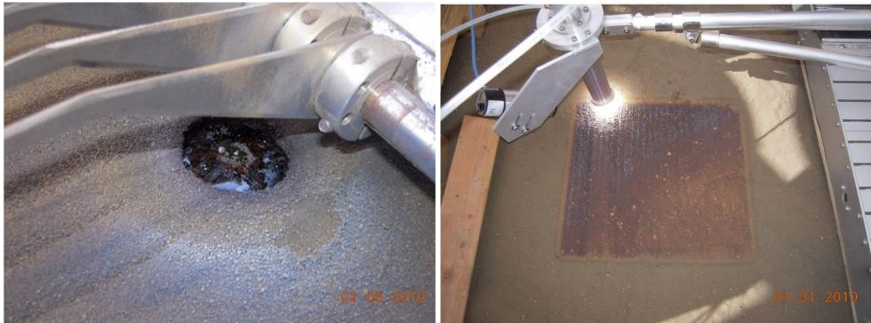
Figure 3. Melting of Tephra at 1800°C (left), and surface sintering at 1100°C (right) demonstrated through solar concentrator (Nakamura & Smith 2011)

A strong candidate for melt pool processes would include solar concentrator technologies. For space-based in situ resource utilization (ISRU), solar power is a readily available heat source. For energy intensive materials processing such as melting and sintering of regolith or rock, direct use of solar power would be an efficient option. However, solar power available from conventional solar concentrator systems is not always an ideal heat source for materials. For example, materials to be processed must be brought to the location where concentrated solar power is available, while electric power can be brought to the location where it is needed. For this reason, electric power, in spite of low overall system efficiency, has been considered as the heat source for most materials processing.