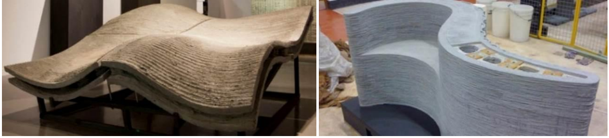
Figure 1. Free-form large scale concrete parts printed at Loughborough University (Le et al, 2012a; Le et al, 2012b; Lim et al, 2012)