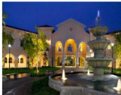
Rosen School of Hospitality

Please join us for the Welcome Reception on Sunday, October 7 th at 7:00pm . This will be held at the Rosen School of Hospitality (9907 Universal Boulevard, Orlando, Florida 32819). Transportation will be provided for the short ride from the Rosen Centre Hotel and will run continuously throughout the evening. There will be heavy Hors d'oeuvres, so there is no need to plan for a dinner. All participants are invited as this is included in the conference registration fee.